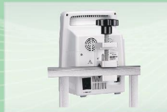
Bed Rail Clamp