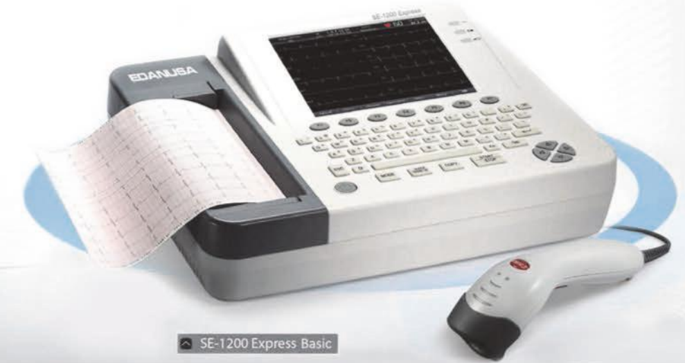
SE-1200 Express Basic